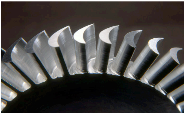
Axial blade row designed with AXIAL.

Real Fluid thermodynamics are integral to AXIAL, which includes built-in support for perfect and semi-perfect fluid properties. Real Fluid Properties are provided through several different fluid databases, including D.B. Robinson Real Fluid Properties, NIST, and ASME Steam. AXIAL also supports condensed gases, user-modifiable fluid properties, and the barotropic fluid thermodynamic model.