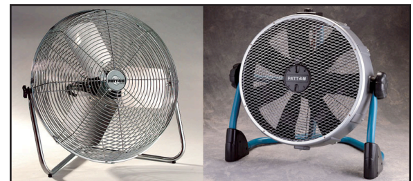
Previous generation Holmes High-Velocity Floor Fan (left) compared to quieter and more efficient new design (right).