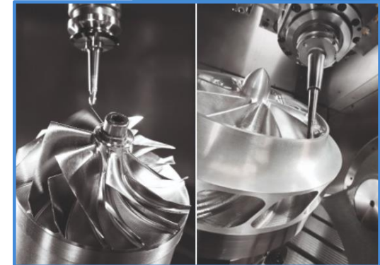
Prototyping or production from <10mm to >1,000mm

AS9100 certified QMS and supply chain management to procure raw materials and special processes