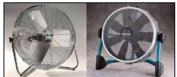
Previous generation Holmes High-Velocity Floor Fan (left) compared to quieter and more efficient new design (right).

Review design performance, analysis, and test data with performance maps that are flexibly plotted and updated automatically with each geometric change.